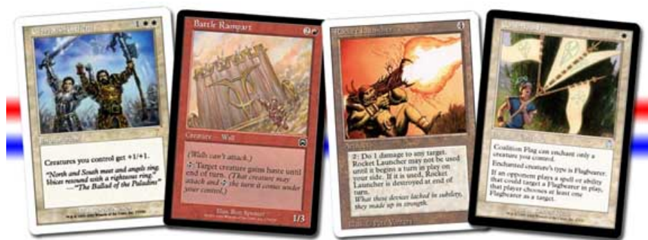
An Anthem, a Rampart, a Rocket, a Flag... what will you put in your All-American deck?

The real word to focus on, however, is "flag." Some combination of Coalition Flag and the Flagbearers ( Coalition Honor Guard and Standard Bearer ) should make their way into the deck.