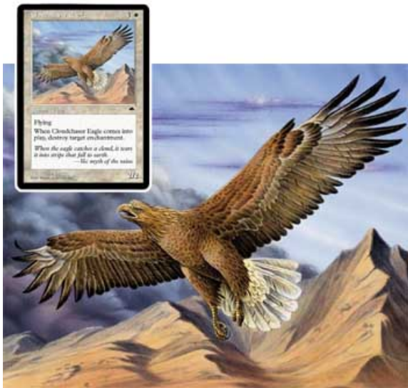
No U.S.A. deck would be complete without eagles.

I just threw a lot of different card choices at you, some of them for very weird reasons. Sifting through the morass and finding a deck that both works reasonably well and looks like a U.S. theme deck is not an easy task. Below are "lite" and "nonlite" ways I might assemble the deck, though you'll almost certainly disagree with my choices.